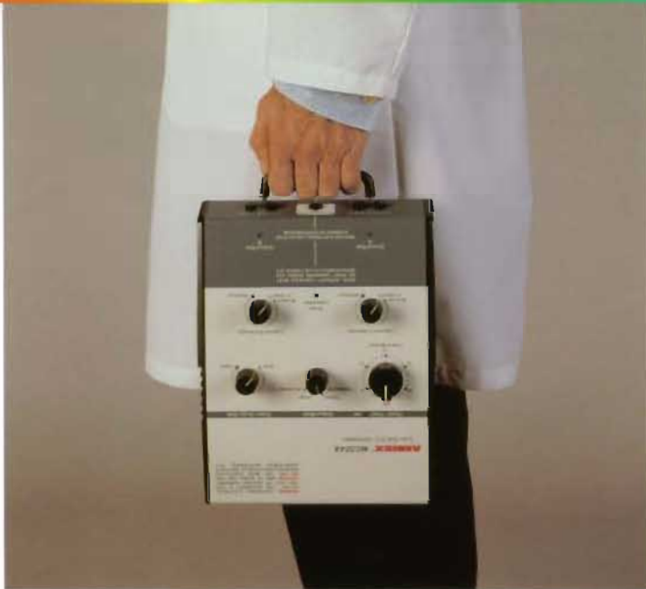
MS324AB Low Volt AC Muscle Stimulator features easy portability