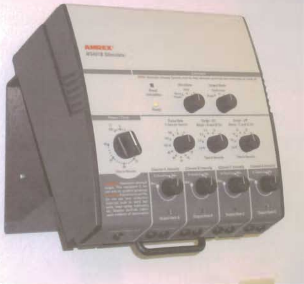
MS401B shown with optional wall mount bracket