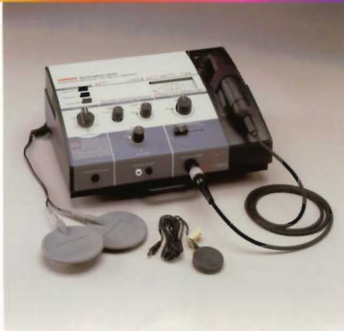
SynchroSonic US/50 provides therapeutic ultrasound and/or muscle stimulation with two pad application